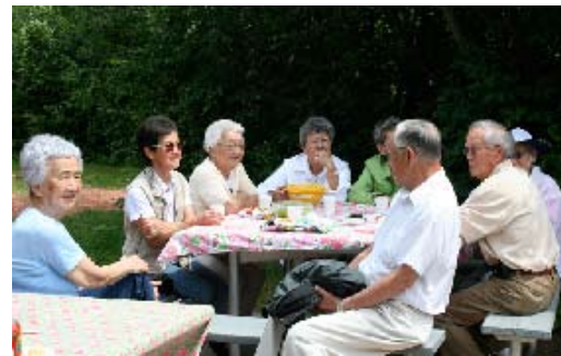
Photos from last year's BTSA picnic