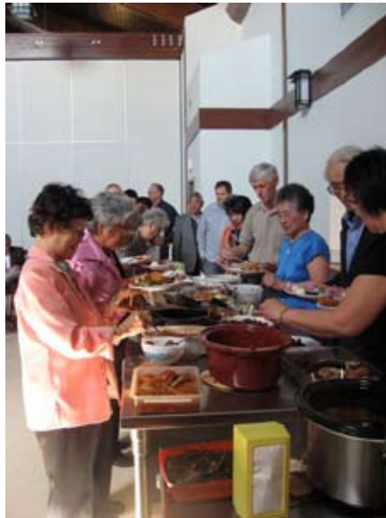
Parents' Day Potluck Lunch