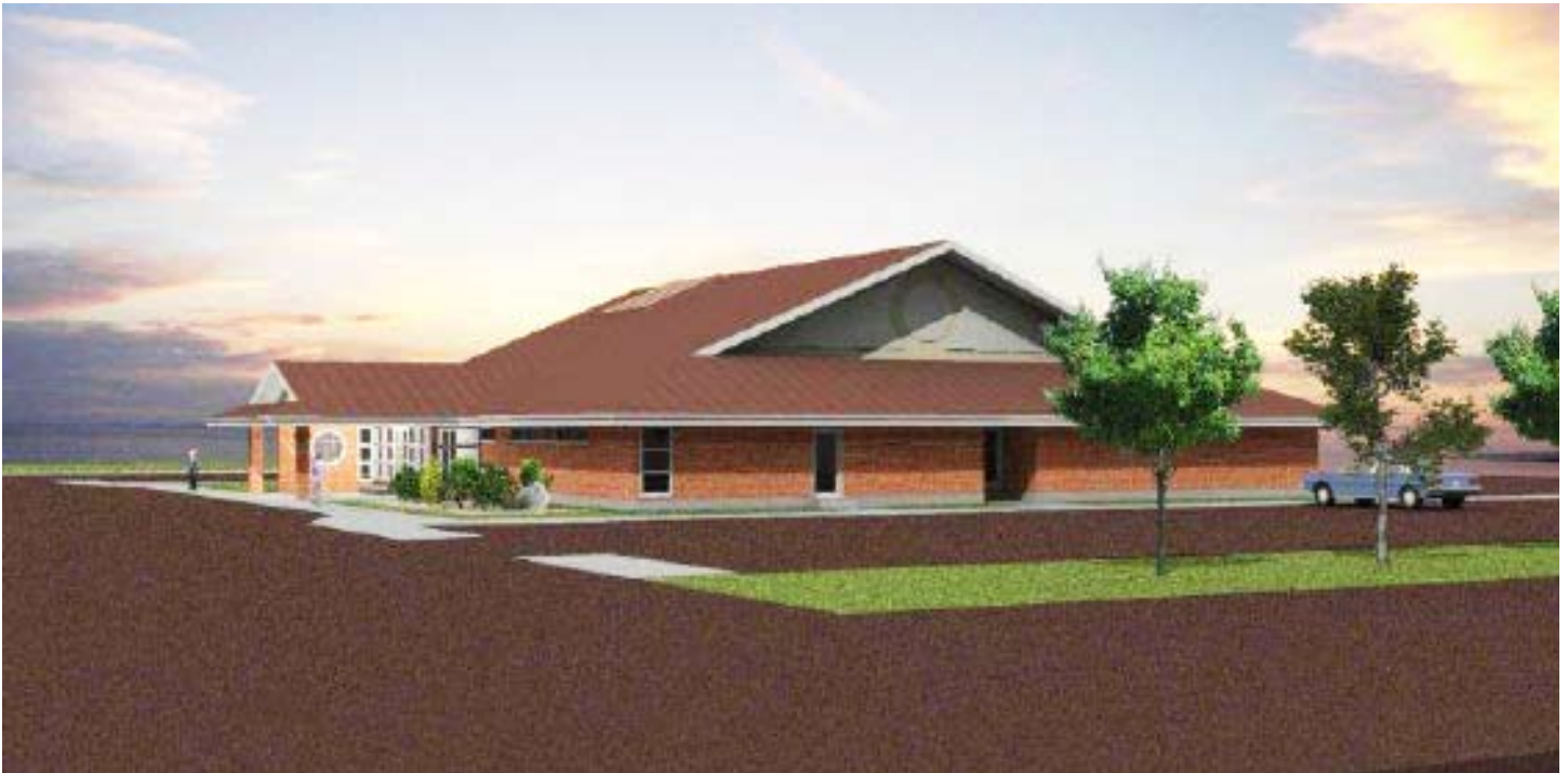
Artist's rendering of new temple