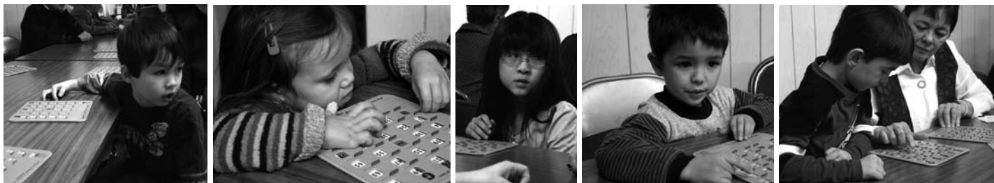
BTSA dharma students concentrate during a game of Bingo at the annual January Ho-onko gathering.