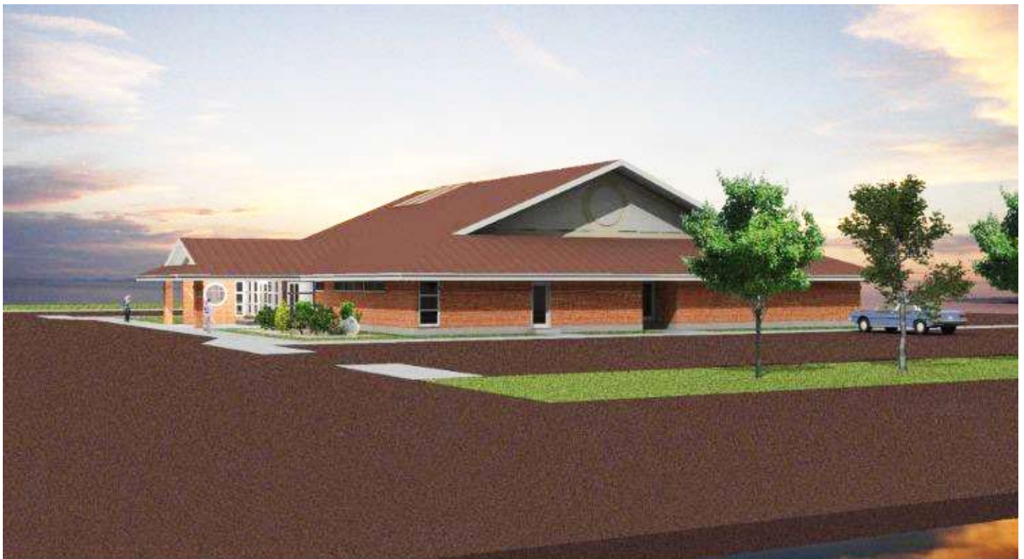
Artist's rendering of new temple